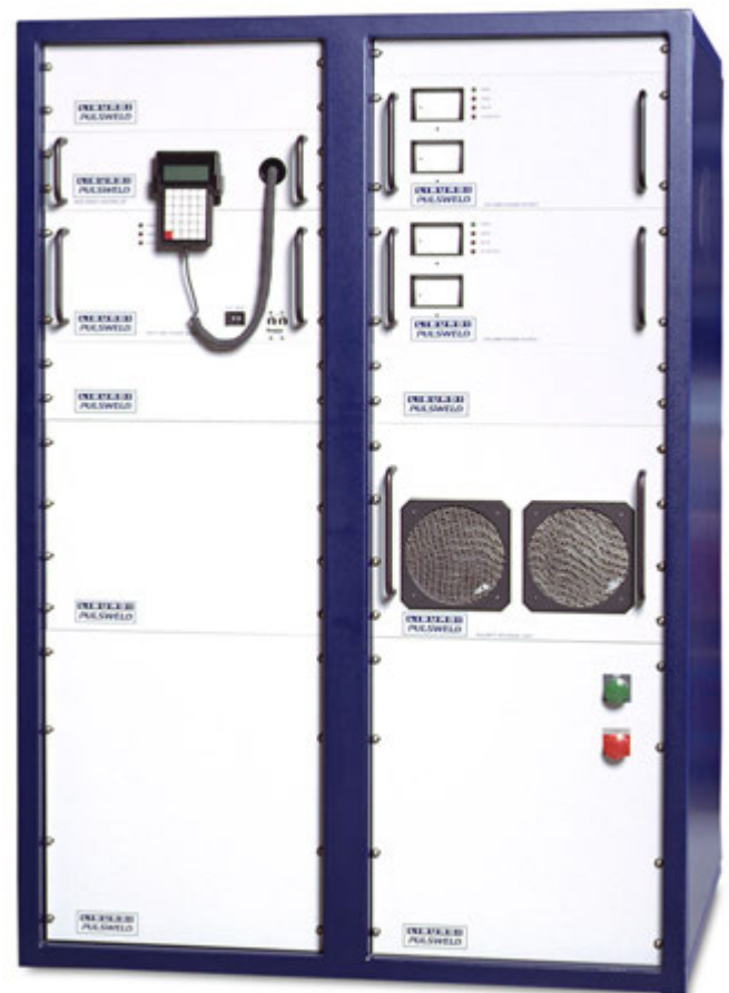
LTP400-VP 400 Amp GTAW/PAW System