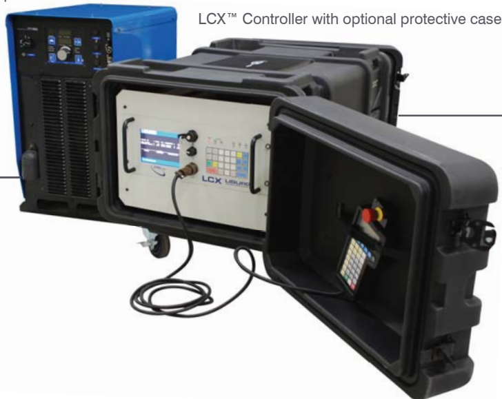
LCX™ Controller with optional protective case