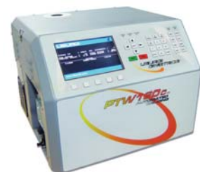
'Liburdi Dimetrics' PTW160c™ is an excellent power supply for the DMF-A1 Weld Head.

USA | tel: 1-704-230-2510 | dimmktg@dimetrics.com INTERNATIONAL | tel: 1-905-689-0734 | liburdi@liburdi.com EUROPE | tel: +31-6-2036-1018 | liburdieurope@liburdi.com www.liburdi.com