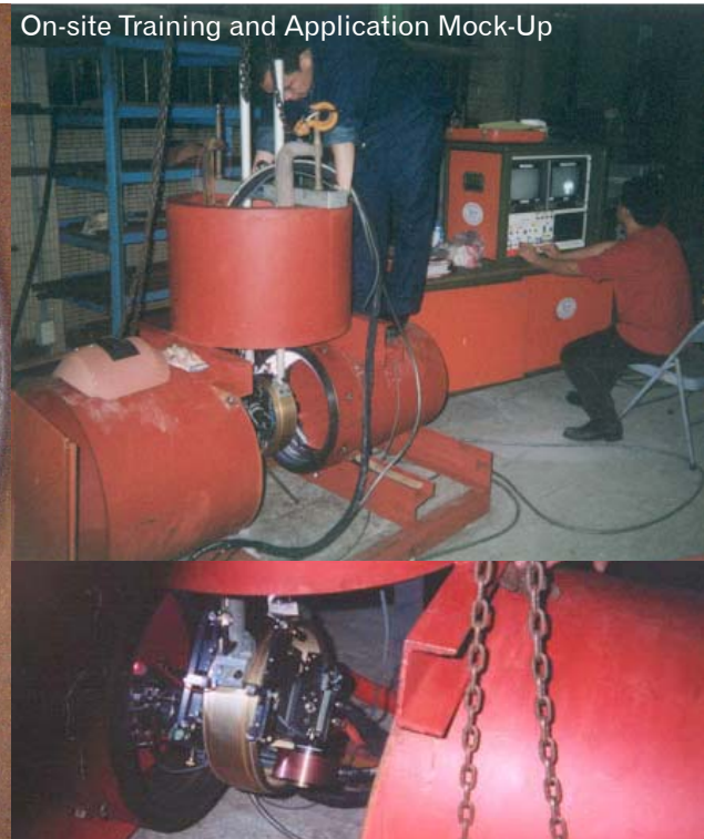
On-site Training and Application Mock-Up