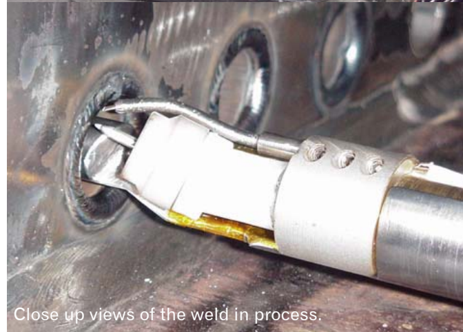
Close up views of the weld in process.